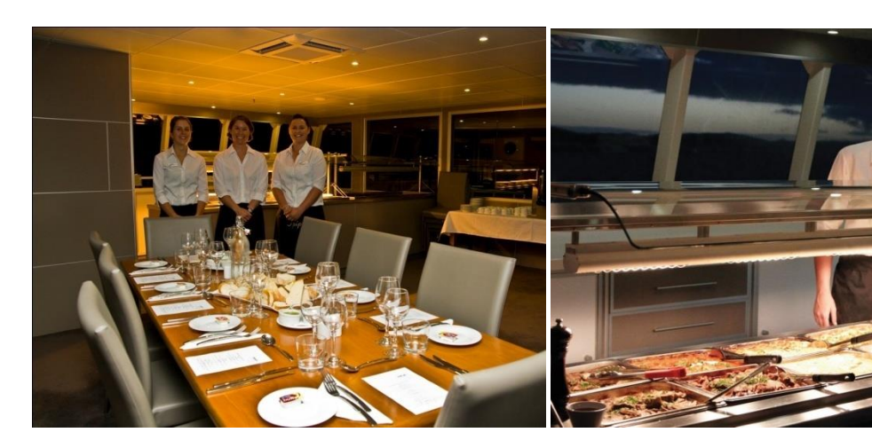
Lounge and Dining