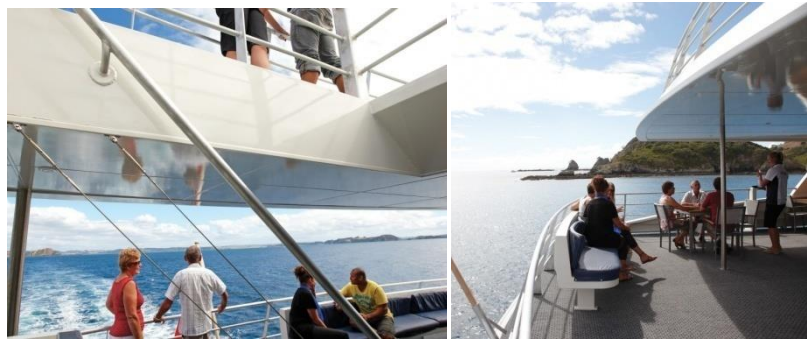
Bridge and upper aft deck area